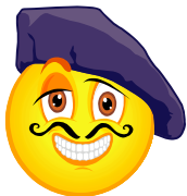
t-1: Fred with moustache